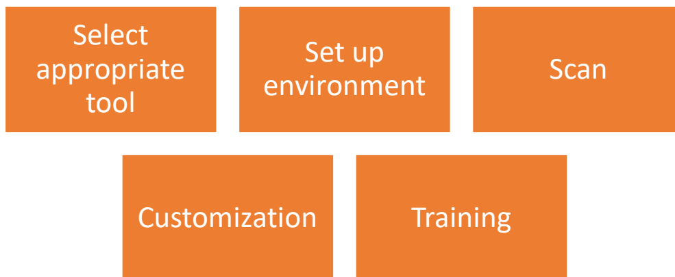
Figure 1 Stages of implementation process of SAST.

Following are the stages of the implementation process of the SAST technique: -